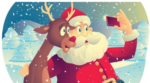
Saturday, December 19th 11:30 AM – 3:00 PM

Santa Claus is coming to the park... Santa will be there from 11:30 AM - 2:00 PM with Mrs. Claus. There will also be a food truck. The 2^{\text{nd}} Annual Holiday light and decorating competition will be judged on Friday, December 18^{\text{th}} . Prizes will be awarded!